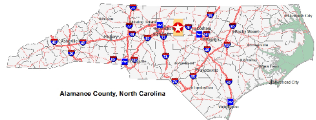
State Map of Whites Kennel 90